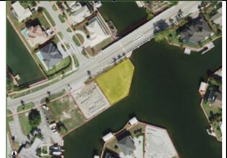
976 N BARFIELD DRIVE, Marco Island, FL 34145

Community: Marco Island Unit: 4 View: Canal; Partial Bay; River; Wide Water Water Front Footage: 201 Waterfront Features: Canal Front; Sea Wall; Age Sea Wall: 1973 Subarea Type: Water Indirect Block: 131 Rear Exposure: Southeast Acres: 0.29 Lot Size Dimensions: 140x110x170x40 Use Code: 00 Parcel Number: 56944720005 Lot: 3 Island Location: River Vehicle Restriction Y/N: No Road Frontage Length: 140 Boat Dock: No