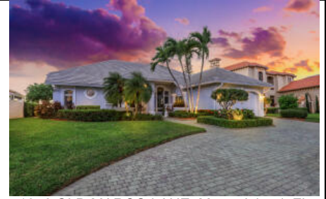
1076 OLD MARCO LANE, Marco Island, FL 34145

Community: Marco Island Unit: 0 Bedrooms Total: 3 A/C SqFt: 2,614 Furnished: Turnkey Garage Spaces: 2 View: Bay; Long Water; Pool; Wide Water Pool Private Y/N: Yes Spa Y/N: Yes Subarea Type: Water Direct Block: 6 Bathrooms Full: 3 Total Area-SqFt: 4,351 Stories: 1 Rear Exposure: West Boat Dock: Yes Architectural Style: Coastal; Contemporary Roof: Tile Water Front Footage: 80 Road Frontage Length: 80 Lot Size Dimensions: 80x150x80x150 Parcel Number: 64614280003 Lot: 10 Bathrooms Half: 0 Meas. for A/C: Property Appraiser Office # Office Den: 1 Year Built: 1979 Island Location: Old Marco Flood Plain: Yes Boat Lift: Yes