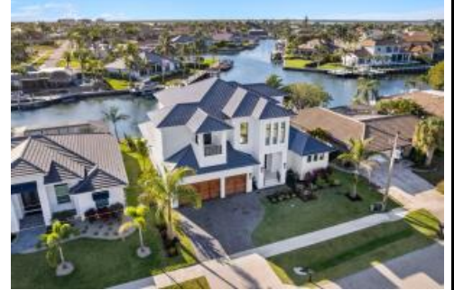
1857 WOODBINE COURT, Marco Island, FL 34145

Community: Marco Island Unit: 2 Bedrooms Total: 4 A/C SqFt: 3,909 Furnished: Negotiable Garage Spaces: 3 View: Canal; Intersecting Canals; Long Water; Wide Water Pool Private Y/N: Yes Spa Y/N: Yes Subarea Type: Water Direct Block: 66 Bathrooms Full: 5 Total Area-SqFt: 5,559 Stories: 2 Rear Exposure: Southeast Carport Spaces: 0 Boat Dock: Yes Architectural Style: Coastal; Contemporary Roof: Tile Water Front Footage: 80 Road Frontage Length: 80 Lot Size Dimensions: 80x110x80x110 Parcel Number: 56803200006 Lot: 11 Bathrooms Half: 0 Meas. for A/C: Architectural Plans # Office Den: 1 Year Built: 2023 Island Location: River Flood Plain: Yes Boat Lift: Yes