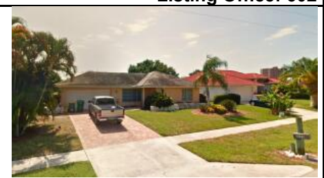
1020 BALTIC TERRACE, Marco Island, FL 34145