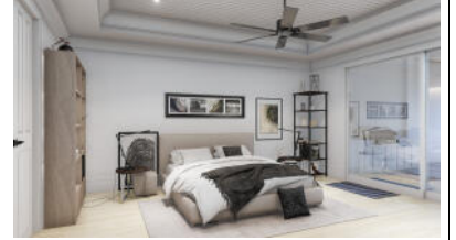
1405 COLLINGSWOOD AVENUE, Marco Island, FL 34145

Community: Marco Island Unit: 9 Bedrooms Total: 4 A/C SqFt: 5,033 Furnished: Unfurnished Garage Spaces: 3 View: Canal Pool Private Y/N: Yes Spa Y/N: Yes Subarea Type: Water Direct Block: 312 Bathrooms Full: 5 Total Area-SqFt: 7,191 Stories: 2 Rear Exposure: South Carport Spaces: 0 Boat Dock: No Architectural Style: Coastal; Contemporary Roof: Tile Water Front Footage: 150 Lot Size Dimensions: 182x150x150x203 Parcel Number: 57806200002 Lot: 1 Bathrooms Half: 0 Meas. for A/C: Property Appraiser Office # Office Den: 1 Year Built: 2022 Island Location: Estate Section Flood Plain: Yes Boat Lift: No