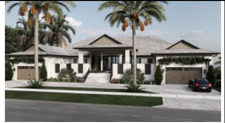
1791 OSCEOLA COURT, Marco Island, FL 34145

Community: Marco Island Unit: 13 Bedrooms Total: 4 A/C SqFt: 4,697 Furnished: Unfurnished Garage Spaces: 4 Guest House Y/N: Yes View: Inland; See Remarks Pool Private Y/N: Yes Spa Y/N: Yes Subarea Type: Inland Block: 405 Bathrooms Full: 4 Total Area-SqFt: 12,288 Stories: 1 Rear Exposure: West Carport Spaces: 0 Boat Dock: No Architectural Style: Coastal; Contemporary Roof: Tile Land Value Y/N: No Water Front Footage: 0 Lot Size Dimensions: 162x129x157x130 Parcel Number: 58107800003 Lot: 3 Bathrooms Half: 1 Meas. for A/C: Architectural Plans # Office Den: 1 Year Built: 2023 Island Location: Estate Section Flood Plain: Yes Vehicle Restriction Y/N: No Boat Lift: No Acres: 0.51