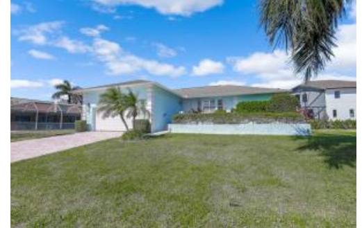
486 LANDMARK STREET, Marco Island, FL 34145

Parcel Number: 57648400002 Lot: 7 Bathrooms Half: 0 Meas. for A/C: Property Appraiser Office # Office Den: 0 Year Built: 1985 Year Remodeled: 2024 Island Location: Center Island South Flood Plain: Yes Vehicle Restriction Y/N: No Boat Lift: No Acres: 0.34