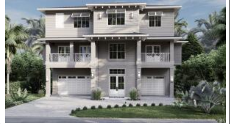
700 WATERSIDE DRIVE, Marco Island, FL 34145

Community: Marco Island Unit: 0 Bedrooms Total: 5 A/C SqFt: 4,610 Furnished: Unfurnished Garage Spaces: 6 Guest House Y/N: No View: Gulf; Trees/Woods Pool Private Y/N: No Spa Y/N: Yes Subarea Type: Inland Block: 12 Bathrooms Full: 3 Total Area-SqFt: 8,548 Stories: 2 Rear Exposure: West Carport Spaces: 0 Boat Dock: No Architectural Style: Coastal; Contemporary Roof: Tile Water Front Footage: 0 Road Frontage Length: 100 Lot Size Dimensions: 99.79x160x80.05x162.64 Parcel Number: 50033880001 Lot: 10 Bathrooms Half: 1 Meas. for A/C: Architectural Plans # Office Den: 0 Year Built: 2023 Island Location: Hideaway Beach Flood Plain: Yes Vehicle Restriction Y/N: Yes Vehicle Restriction Remarks: Limited Number Vehicles, No RV, No Truck Boat Lift: No Acres: 0.33