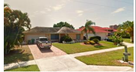
1020 BALTIC TERRACE, Marco Island, FL 34145

Community: Marco Island Subarea Type: Inland Parcel Number: 57870240001 Unit: 10 Block: 345 Lot: 6 Bedrooms Total: 2 Bathrooms Full: 2 Bathrooms Half: 0 A/C SqFt: 1,155 Total Area-SqFt: 1,585 Meas. for A/C: Property Appraiser Office Furnished: Unfurnished Stories: 1 # Office Den: 0 Garage Spaces: 2 Rear Exposure: South Year Built: 1980 Guest House Y/N: No Carport Spaces: 0 Island Location: Southend View: None Boat Dock: No Flood Plain: Yes Pool Private Y/N: No Architectural Style: Ranch Vehicle Restriction Y/N: No Spa Y/N: No Roof: Shingle Boat Lift: No Land Value Y/N: No Acres: 0.2 Water Front Footage: 0 Road Frontage Length: 80 Lot Size Dimensions: 80x110x80x110