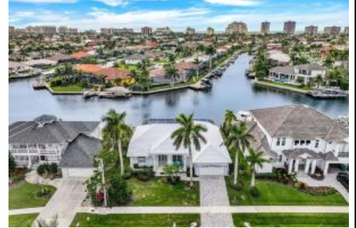
1159 WHITEHEART COURT, Marco Island, FL 34145

Community: Marco Island Unit: 7 Subarea Type: Water Indirect Block: 207 Parcel Number: 57672720004 Lot: 33 Bedrooms Total: 3 A/C SqFt: 2,200 Bathrooms Full: 2 Total Area-SqFt: 3,898 Bathrooms Half: 1 Meas. for A/C: Property Furnished: Furnished Garage Spaces: 2 Stories: 1 Rear Exposure: Southwest Appraiser Office # Office Den: 1 Guest House Y/N: No View: Canal; Intersecting Carport Spaces: 0 Boat Dock: No Year Built: 1994 Island Location: Center Island Canals; Long Water; Wide Water Architectural Style: Coastal; Contemporary Flood Plain: Yes Vehicle Restriction Y/N: No Pool Private Y/N: Yes Spa Y/N: Yes Roof: Tile Land Value Y/N: No Boat Lift: No Acres: 0.2 Water Front Footage: 80 Road Frontage Length: 80 Lot Size Dimensions: 80x110x80x110